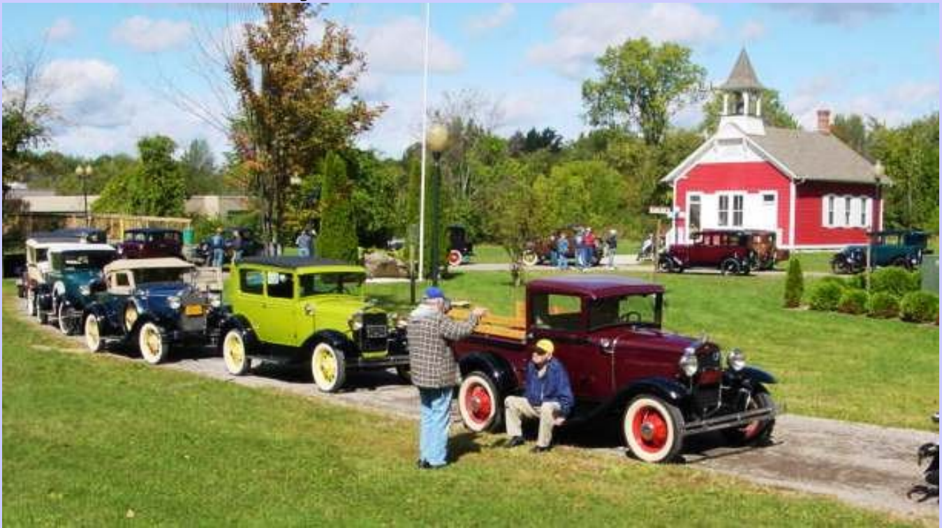
The Historical Village was visited by a Model A tour this September.

The Chesterfield Historical Society had many activities in 2012. On June 9 and 10, the Ste. Claire Voyageurs had a campout in the village for the second year in a row. The Voyageurs illustrate how the original settlers in this area arrived and how they lived after settling in the area.