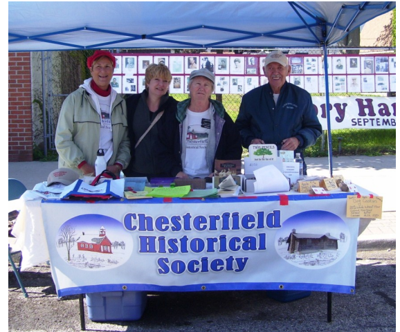
At the New Baltimore History Fair, Sept. 2012